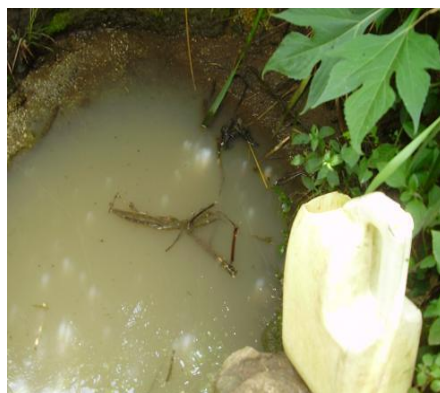
How most Ugandans got their water before Compassion Care helped put in wells