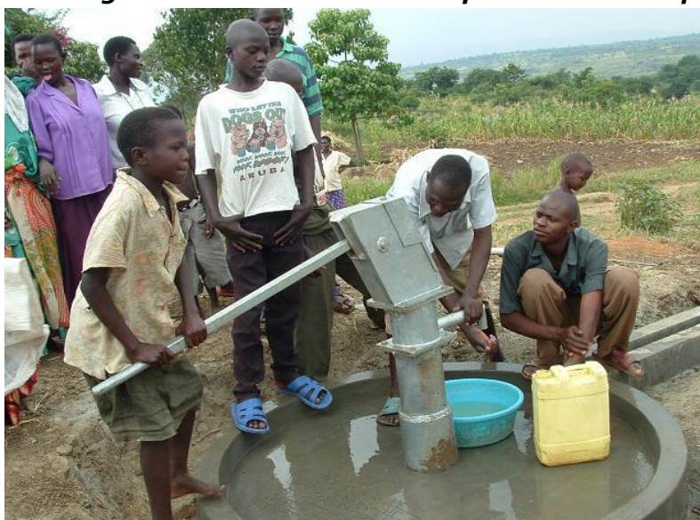
Villagers getting water using the well Compassion Care funded